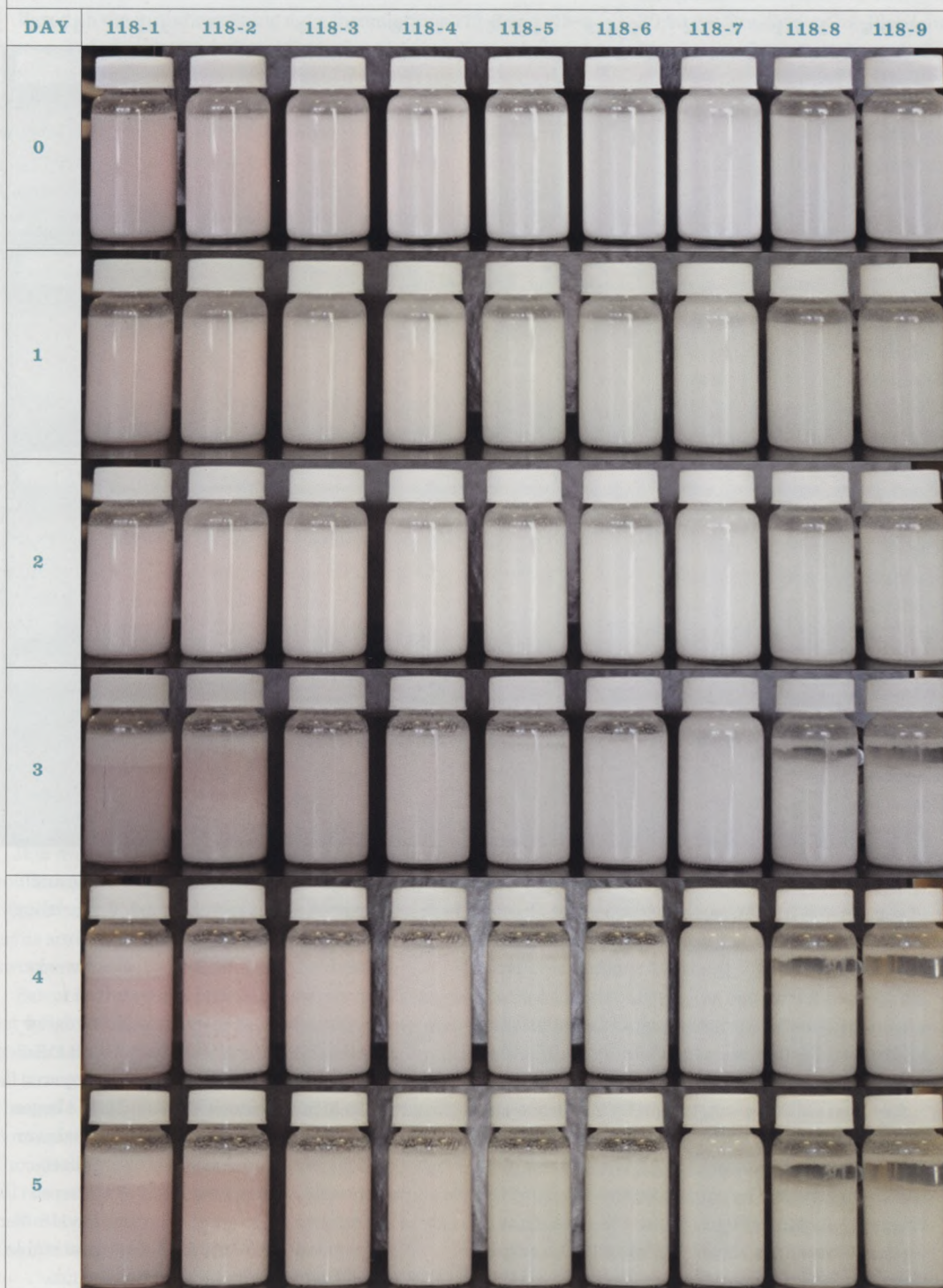
FIGURE 1A. PHYSICAL APPEARANCE OF ESLICARBAZEPINE ACETATE SUSPENSION FORMULATIONS AFTER 0 TO 5 DAYS.

the analysis of the current oral suspension formulations. Briefly, the analysis was performed using a Shimadzu HPLC system (Model LC-2010AHT) equipped with a Phenomenex C18 column (Luna, 150 × 4.6 mm, 3 μ, and 100 Å). The mobile phase consisted of a methanol and water mixture (50:50 v/v) with 0.1% trifluoroacetic acid. The mobile phase flow rate was set at 0.8 mL/minute, and the column oven was set at 40°C. The sample injection volume was 3 μL, and the detection wavelength was set at 230 nm. Under these conditions, the retention time of ESL was observed to be about 8.9 minutes.