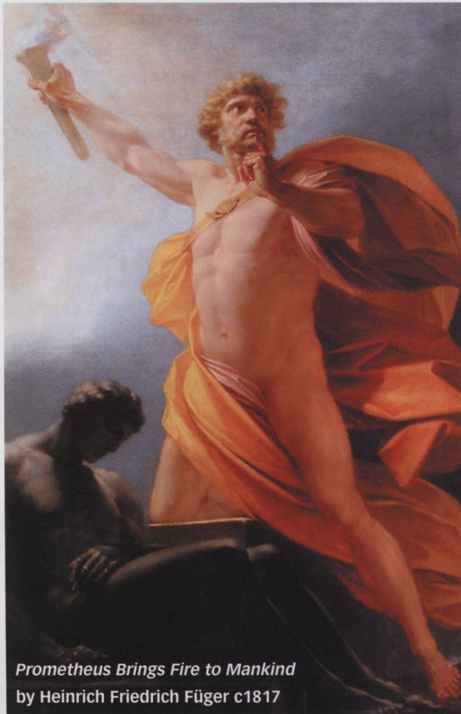
Prometheus Brings Fire to Mankind by Heinrich Friedrich Füger c1817