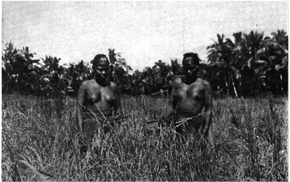
Figure 1: Tagbanua women harvesting rice, Calaminanes Islands, from The National Geographic Magazine , May 1903.

It is hard to overstate The National Geographic Magazine's importance as a primary source of information about the world for middle class American readers through much of the twentieth century